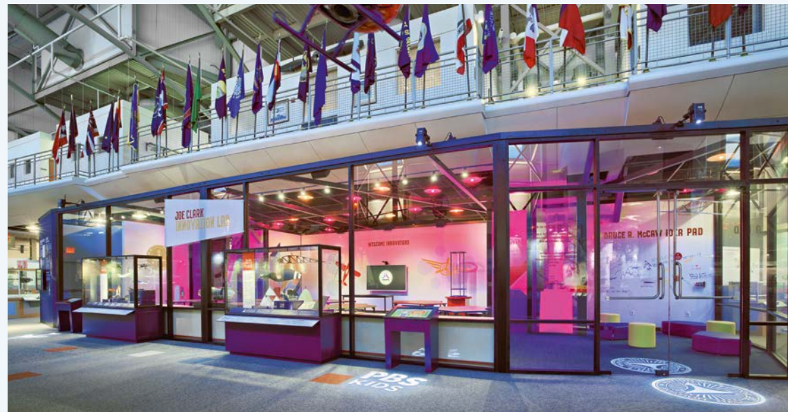
This page: The NAHF, based in Dayton, OH, honors the most influential figures in aviation history, celebrating pioneers, innovators and leaders who have made significant contributions to the field

For donors, this is philanthropy with measurable lift, funding educator toolkits aligned to STEM standards, scholarships that close gaps, and immersive experiences that demystify aerospace careers. Embraer supports these efforts through targeted program funding, employee mentorship and strategic visibility that extends the Hall's reach to new audiences.